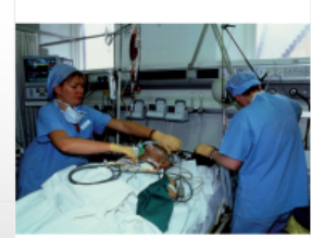
Case Reports in Critical Care